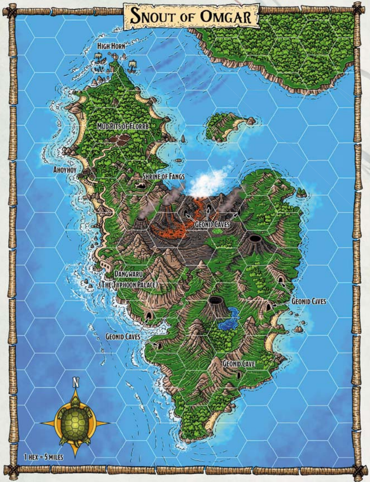
MAP 1: SNOUT OF OMGAR