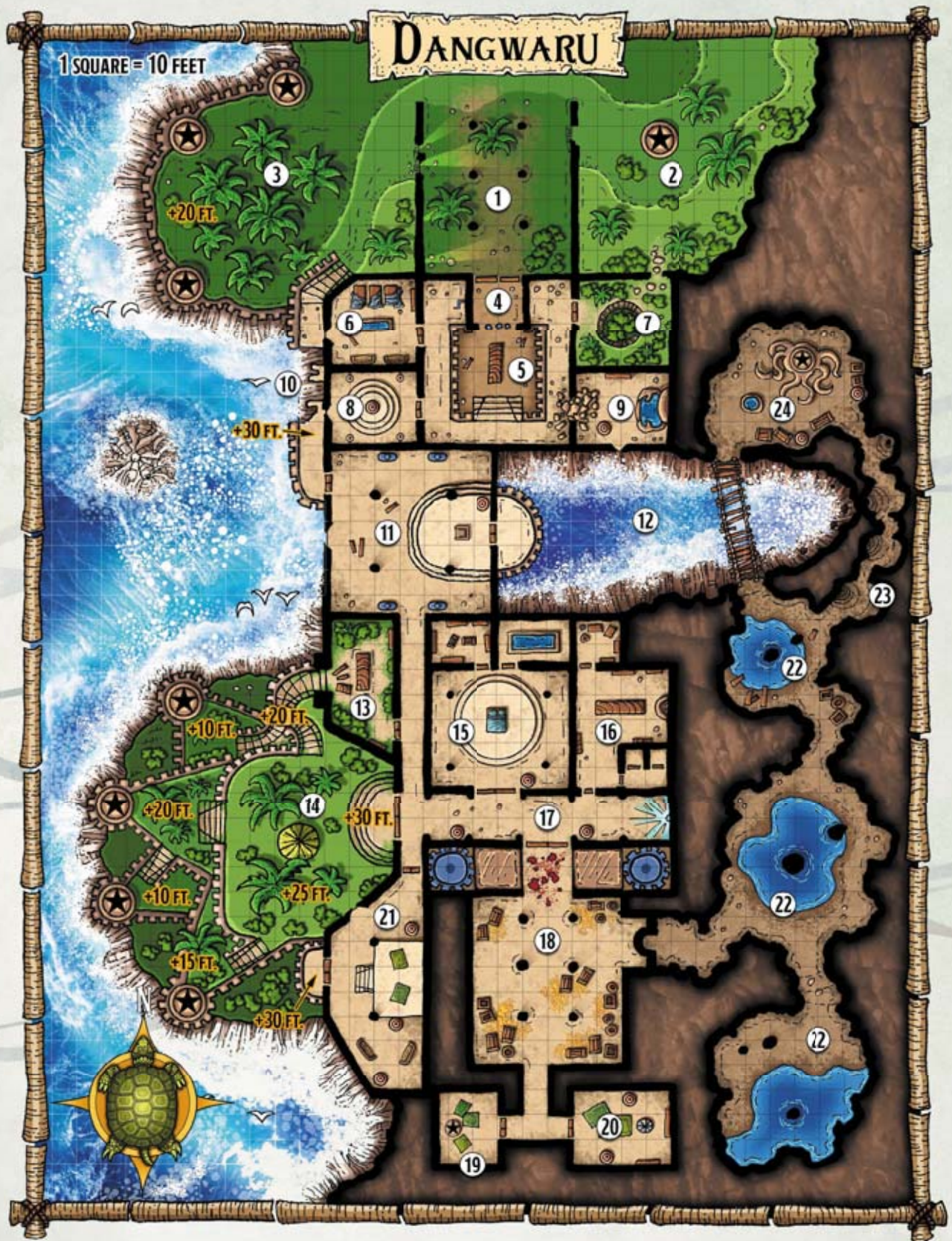
MAP 3: DANGWARU